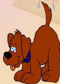
Oak Ridge Schools' Preschool Home of the Preschool Pup

For 40 years, Oak Ridge Schools' Head Start Program has provided a high quality preschool education to children and families in Oak Ridge. We are an integral part of Oak Ridge Schools which allows for continuity of learning, family services and support. We have a blended funding program that uses Head Start, Title I, Pre-K and special education dollars.